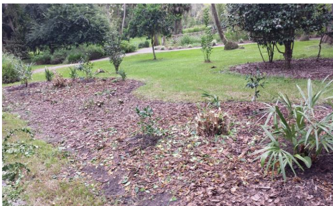
New part of camellia garden; still needs work.